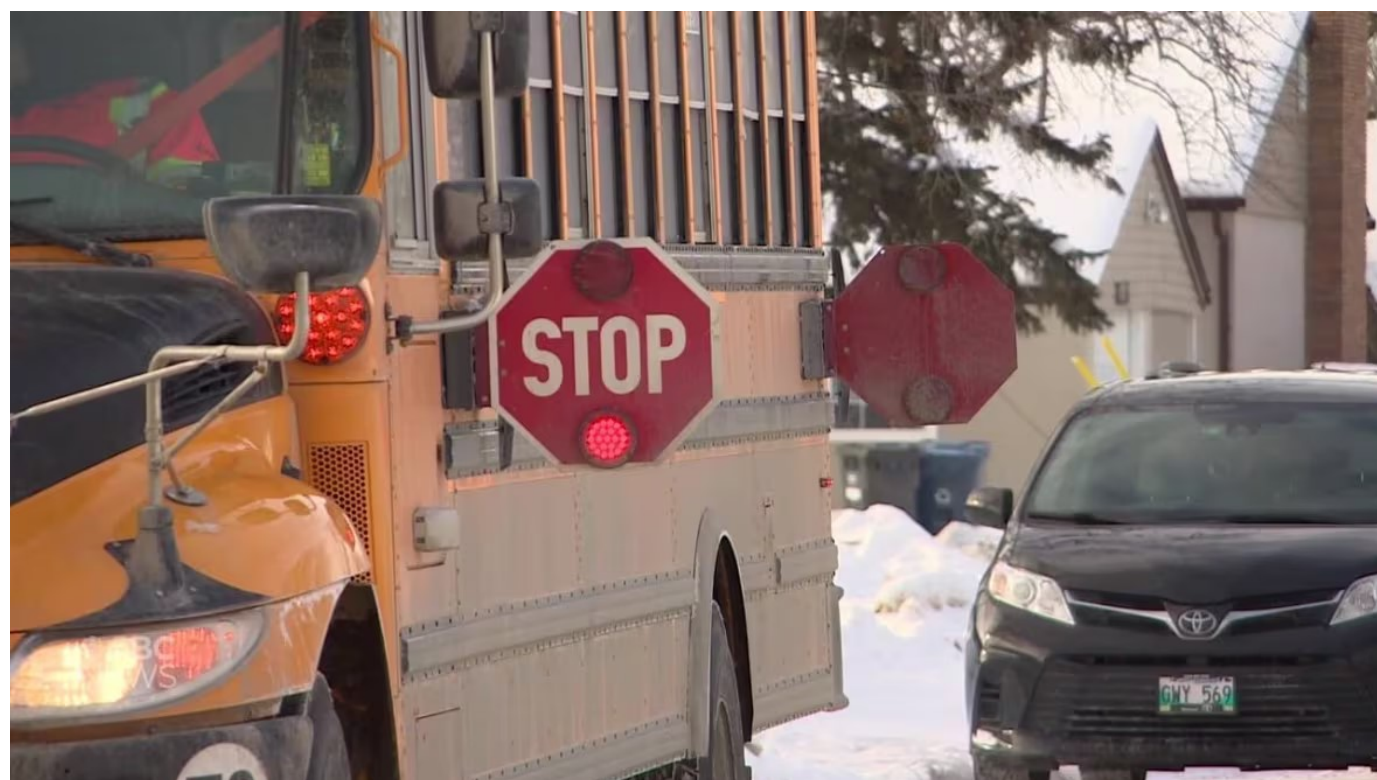
Students who live closer to school in Alberta will be eligible for subsidized school busing by 2024. (CBC)

The proposed education budget allots nearly $421 million for student transportation in the 2023-24 school year. Elementary school students who live more than one kilometre from school would now qualify for school busing. Grade 7 to 12 students who live more than two kilometres away would also qualify for subsidized transportation.